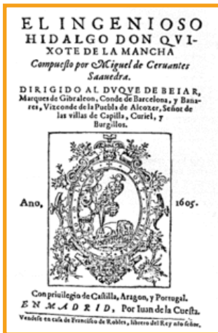
Title page of the first edition of Don Quixote (1605)