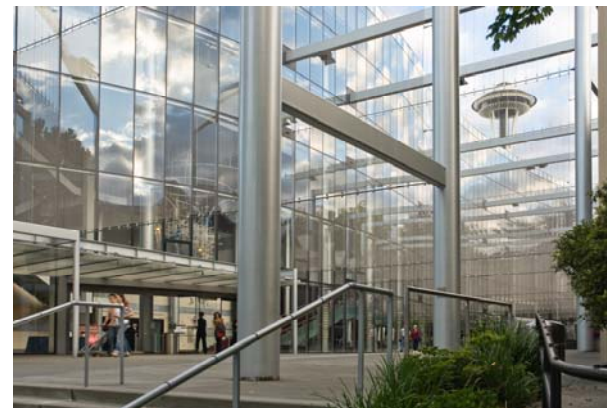
Photos (top to bottom) Second grade students arrive at McCaw Hall Elementary students at McCaw Hall Marion Oliver McCaw Hall