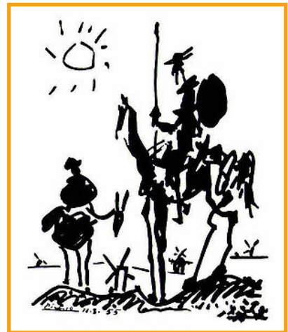
Don Quixote Pablo Picasso (1955)

The ballet Don Quixote is based on the novel Don Quixote de la Mancha , by Miguel de Cervantes, originally published in two parts in 1605 and 1615. The story has served as inspiration for countless works of art, theater, music, opera, dance and film. The first known ballet interpretation was presented in Vienna in 1740 and focused on the central character of Don Quixote. Later versions focused on the second part of Cervantes' novel focusing on the story of lovers Kitri and Basilio. In 1869, choreographer Marius Petipa premiered his version at the Bolshoi Ballet in Russia, accompanied by a commissioned score by Ludwig Minkus. This version continues to serve as the foundation for present-day versions of the ballet.