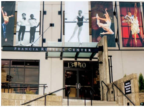
The Francia Russell Center.