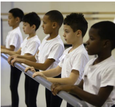
Pacific Northwest Ballet School DanceChance students.